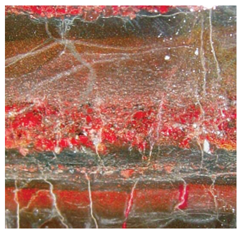
Fig. 4. Typical sedimentary (syngenetic) ore in tuffite. Light grains: chalcedony intercalated with cinnabar.

were accompanied by the extensive collection of samples. The findings of mine geologists are collected in three doctoral dissertations and over 30 geological papers.