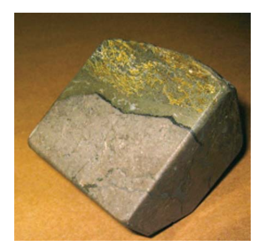
Fig. 3. Middle Triassic erosional unconformity. Ladinian pyritized kaolinite sandstone lying on eroded Anisian dolomite (light).