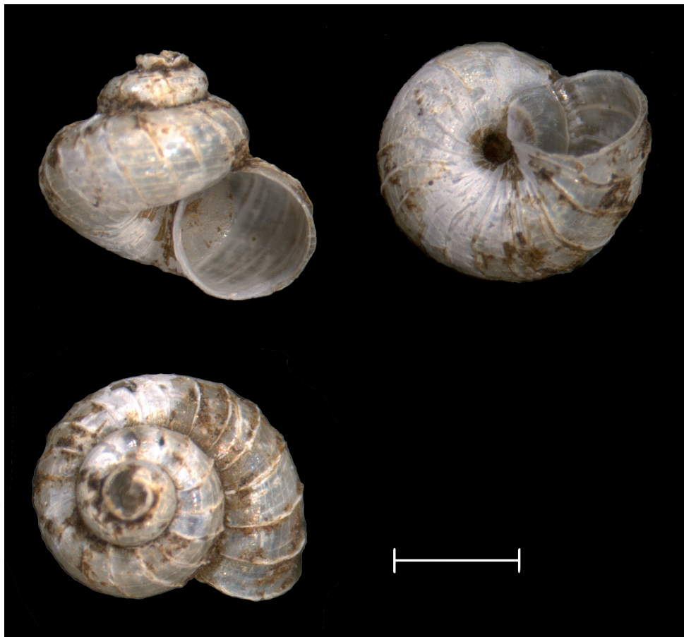
Figs 5-7. Different views of paratype shell of Maizaniella sapoensis spec. nov. (RMNH 113994). Scale bar 1 mm.