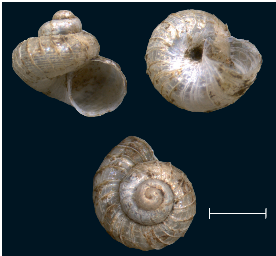
Figs 2-4. Different views of holotype shell of Maizaniella sapoensis spec. nov. (RMNH 113993). Scale bar 1 mm.

limbus ballmanni ) (see Anonymous, 2008).