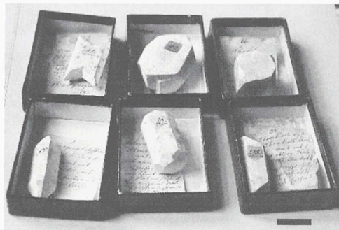
Fig. 1. Crystallographic models, made by Franz-Xaver Zippe. Scale bar represents 3 cm.

The local collection followed another principle, much more apt for illustrating the occurrence of specimens in the Bohemian geological landscape. Zippe, who was also a thoroughly informed geognost, organized the minerals according to their places of origin, and arranged these places according to their topographic location among the Bohemian mountain ranges and formations. Parallel with that set up he placed the species of rocks of each mountain range and each formation. He classified the formations according to Alexandre Brongniart (1829). Again, a label was added to each mineral sample, briefly telling its crystallographic and mineralogic characteristics. Therefore, at a glance it was possible to recognize, which mineral occurs at what geographic