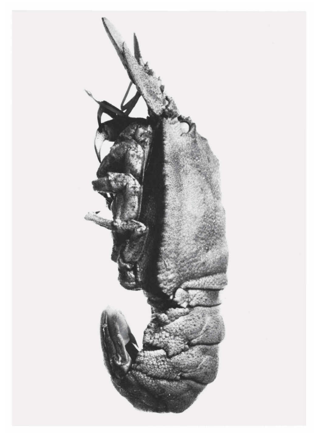
Fig. 2. Scyllarides obtusus spec. nov., paratype male in lateral view. Saint Helena, 1909, J.T. Cunningham (B.M.).