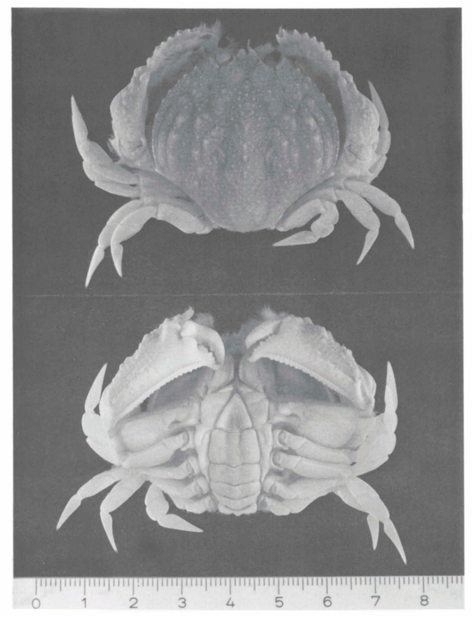
Fig. 1. Cycloes cristata , female specimen (RMNH Crust. 36610), dorsal and ventral view. (photo E. L. M. van Esch).

material I made some interesting field observations. At Punta de Papagayo Cycloes cristata proved fairly common. The crabs were rather wary and as soon as I moved down towards them they dug themselves rapidly into the sand.