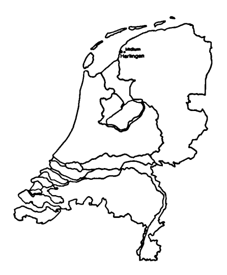
Fig. 2. Sketch map indicating the location of the Midlum terp.

already been mentioned. Of these, the P_3 appears to have a single root while M_1 possesses a double root. P_4 seems to occupy an intermediate position with respect to this feature, because it displays a single root morphology at its lingual side but a double root on the vestibular side. All three unicuspid teeth have crowns which are entirely surrounded by basal cingula, most strongly developed at their lingual sides. Sagittal crests run over each tooth from front to back. In these cristae one encounters accessory cuspids at the distal side of M_1 , at the distal and mesial sides of P_4 , and at the mesial side of P_3 . The colour gradation of the dental enamel is almost identical to that of the rest of the subfossil specimen, 10 YR 6/3.