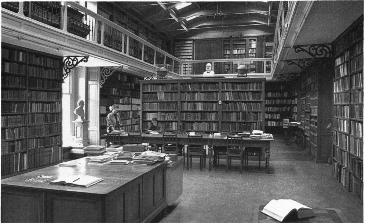
Fig. 3. Reading room of the Artis Library in 1988. The bust on the left represents G. F. Westerman and the one in the middle Charles Darwin.