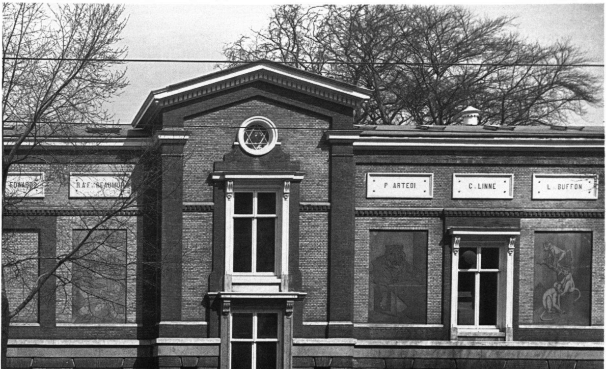
Fig. 4. Detail of the façade of the "fauna building" showing some of the marble plates with names of famous scientists.