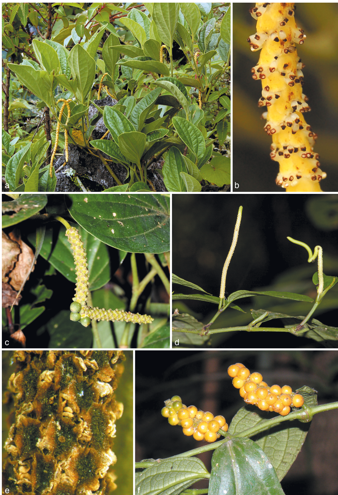
Fig. 1 a–c: Piper chiangdaoense Suwanp. & Chantar. a. Plant habit; b. portion of male inflorescence; c. infructescence. — d–f: Piper trichostigma (Chaveer. & Sudmoon) Suwanp. & Chantar.: d. male inflorescences; e. floral bracts and stamens; f. infructescences.