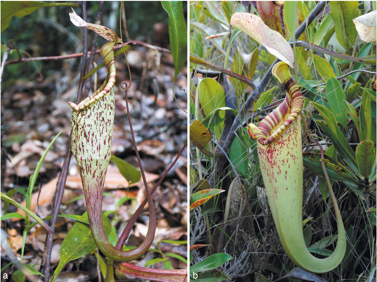
Fig. 1 a. Upper pitcher of N. baramensis C. Clarke, J.A. Moran & C.C. Lee, Brunei. Note the funnel-shaped lower portion of the pitcher, distinct hip, and cylindrical upper portion. The waxy zone of this pitcher occupies the cylindrical portion on the inner surface. In this example, the peristome is raised slightly at the front of the mouth. This feature is generally absent or greatly reduced in N. baramensis . – b. An upper pitcher of N. rafflesiana Jack from Johor, Peninsular Malaysia. The pitcher is funnel-shaped throughout, the hip is visible only at the front of the pitcher, and is located immediately beneath the peristome. There is no waxy zone inside the pitcher.