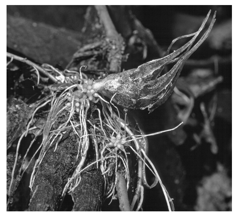
Fig. 2. Afrothismia foertheriana Th. Franke, Sainge & Agerer. Habit. ( Th. Franke & M. Sainge 02/030 ).