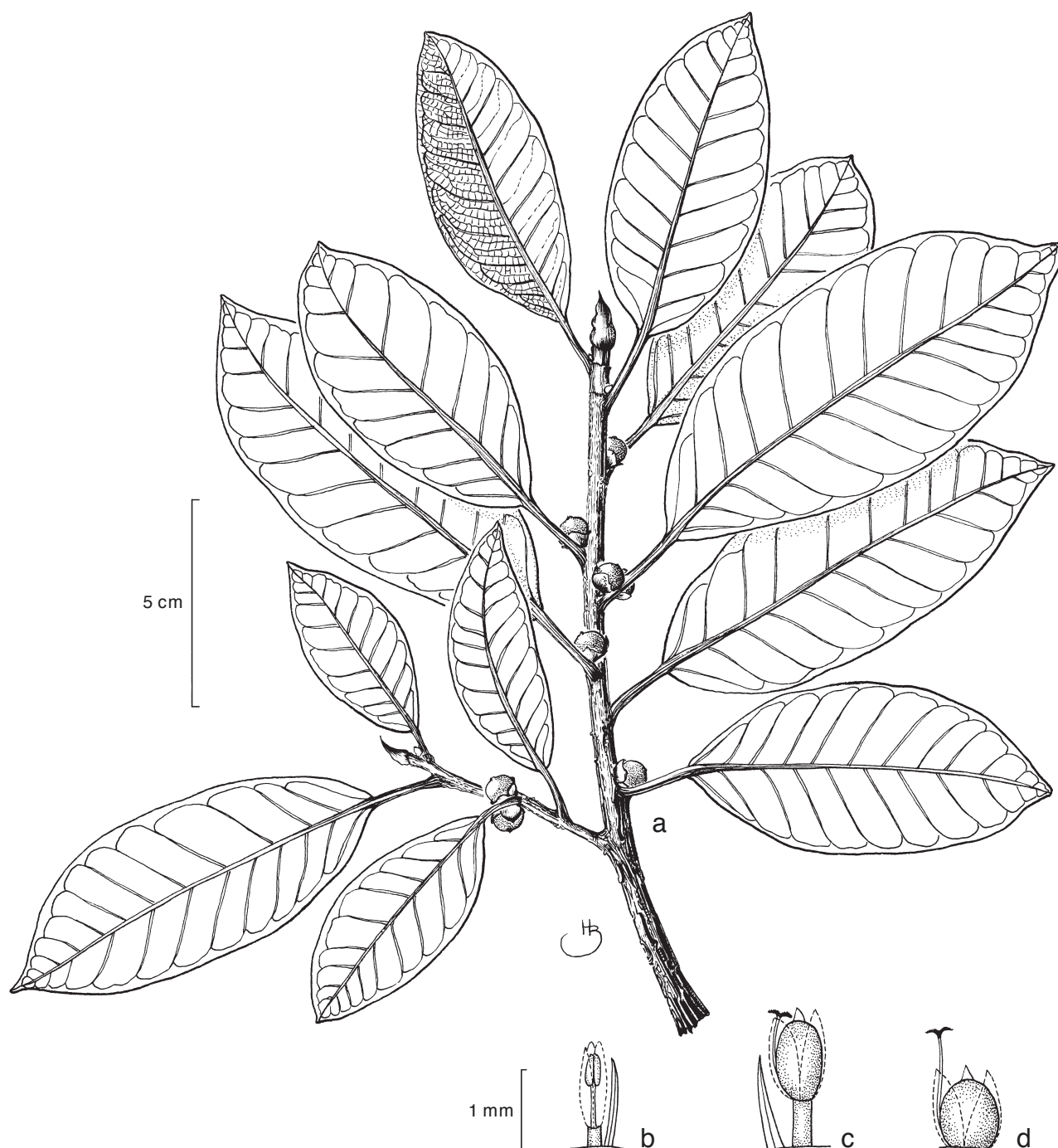
Fig. 1 Ficus machupicchuensis C.C.Berg. a. Leafy twigs with figs; b. staminate flower and interfloral bract; c. short-styled flower with interfloral bracts; d. long-styled pistillate flower (all: Huamantupa et al. 3914, BG). — Drawing by Hendrieke Berg (Voss).

c. 3 mm diam; peduncle 1–2 mm long, receptacle c. 1.5–2 mm diam; involucre bracts in 2–3 series, ovate, 1.5–2.5 mm long, whitish appressed-puberulous; flowers c. 10–20; perianth c. 1 mm long, tepals subdecussate, two by two slightly different, (sub)cucullate, the margin ciliolate with crinkled hairs; stamens 4, about equal, filaments c. 2.5 mm long, anthers c. 0.6 mm long, not apiculate.