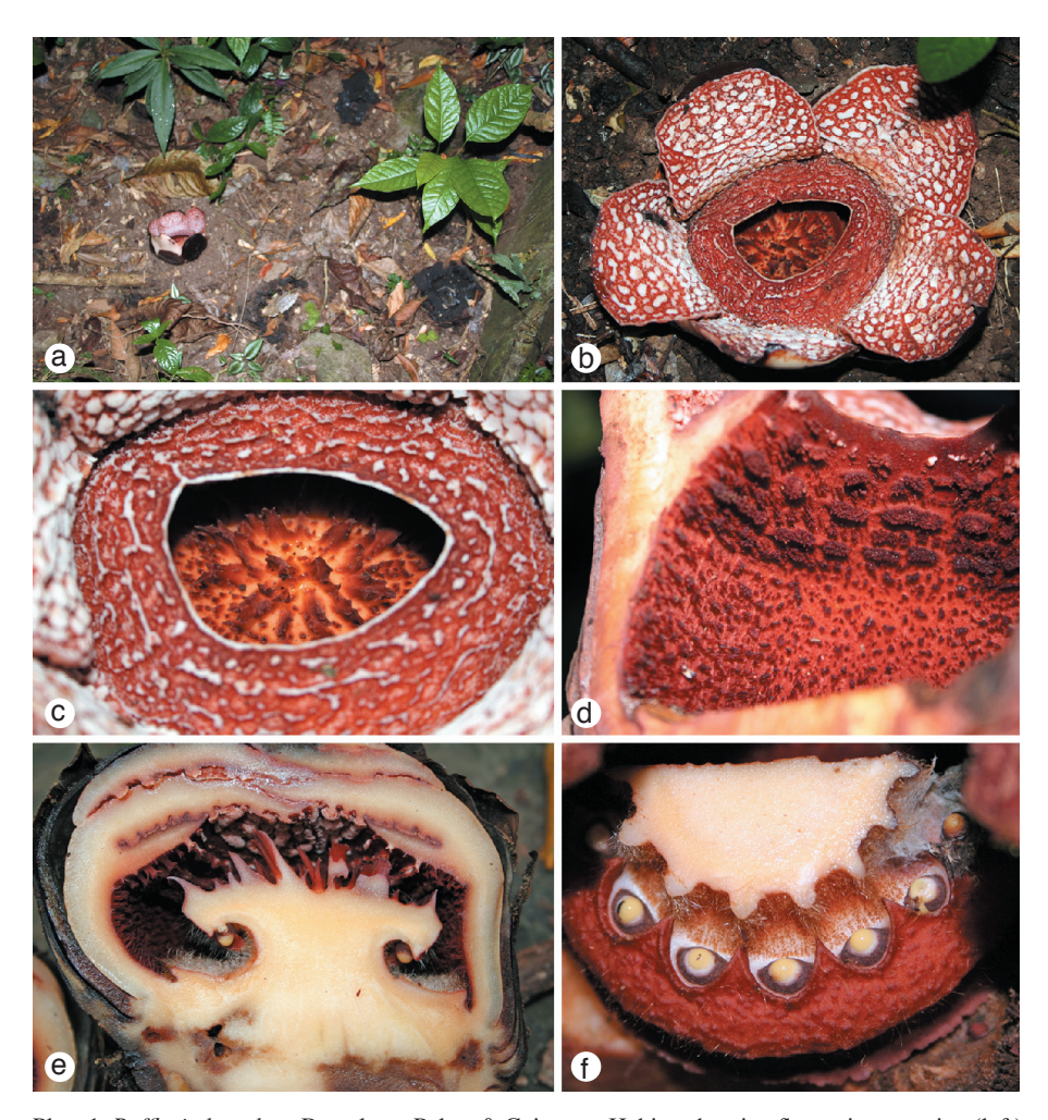
Plate 1. Rafflesia banahaw Barcelona, Pelser & Cajano. a. Habitat showing flower just opening (left) and senescent flower (right); b. a newly-open male flower; c. diaphragm opening through which is visible the processes on the top surface of the disk; d. ramenta on the inner surface of the diaphragm and perigone tube; e. column (cut surface of neck at bottom) showing anthers below the disk corona; f. longitudinal section of a male floral bud (a–d, f: Barcelona, Cajano & Mendua 3345 (holotype); e: Barcelona, Cajano & Mendua 3345 (isotype)).