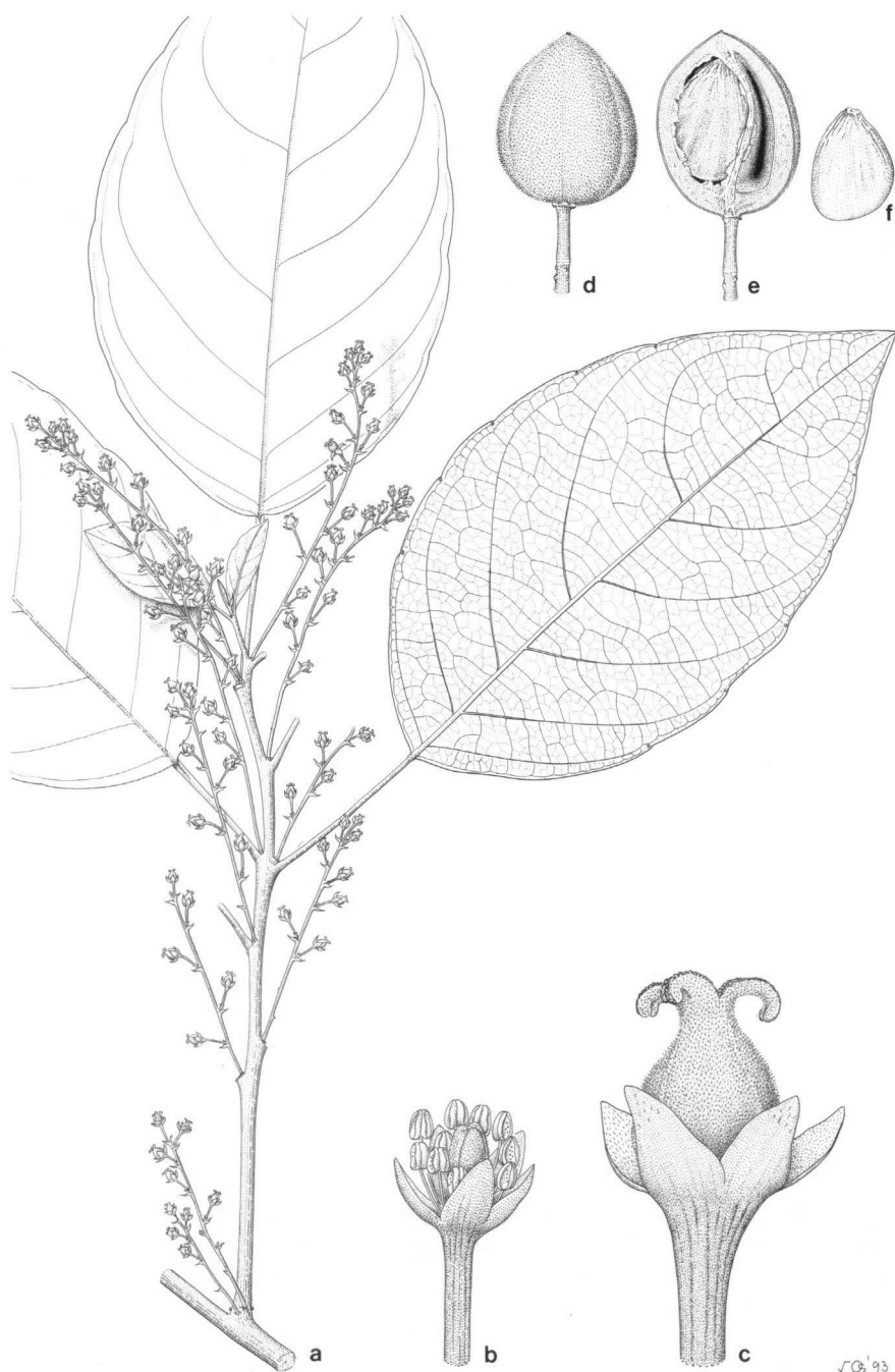
Fig. 1. Cheilosa montana Blume. a. Habit, \times 0.5 ; b. male flower, \times 6 ; c. female flower, \times 6 ; d. fruit, \times 0.5 ; e. fruit, showing thick wall and one developed seed, \times 0.5 ; f. seed covered by aril, \times 0.5 (a, c: Wenzel 147, MO; b: Wenzel 161, A; d–f: KEP FRI (Whitmore) 4165, L).