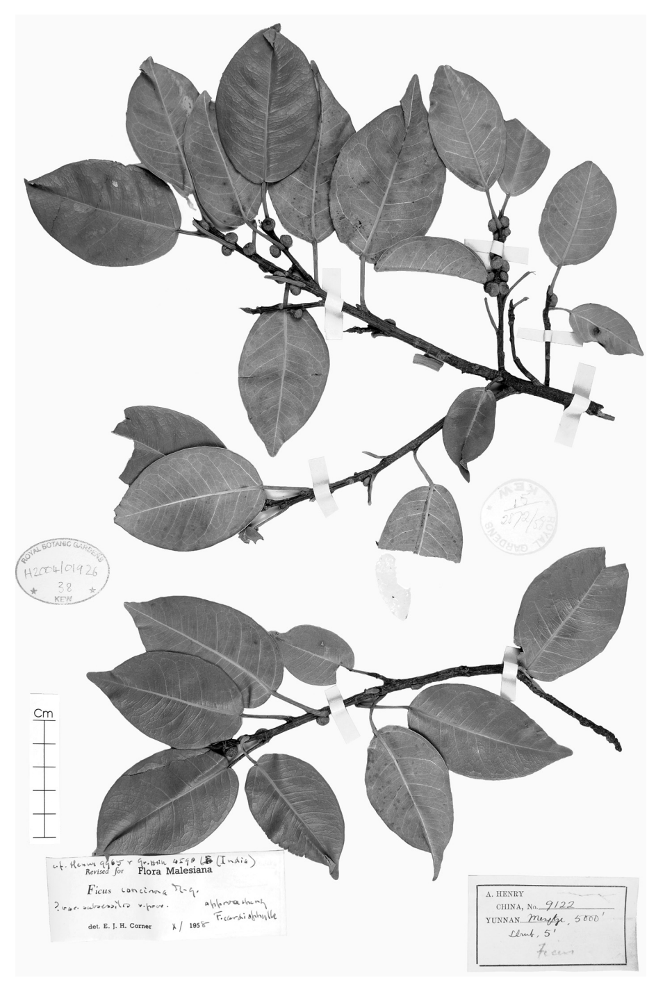
Fig. 1. Ficus alongensis Gagnep., Henry 9122 (K), China, Yunnan, 5000 ft.