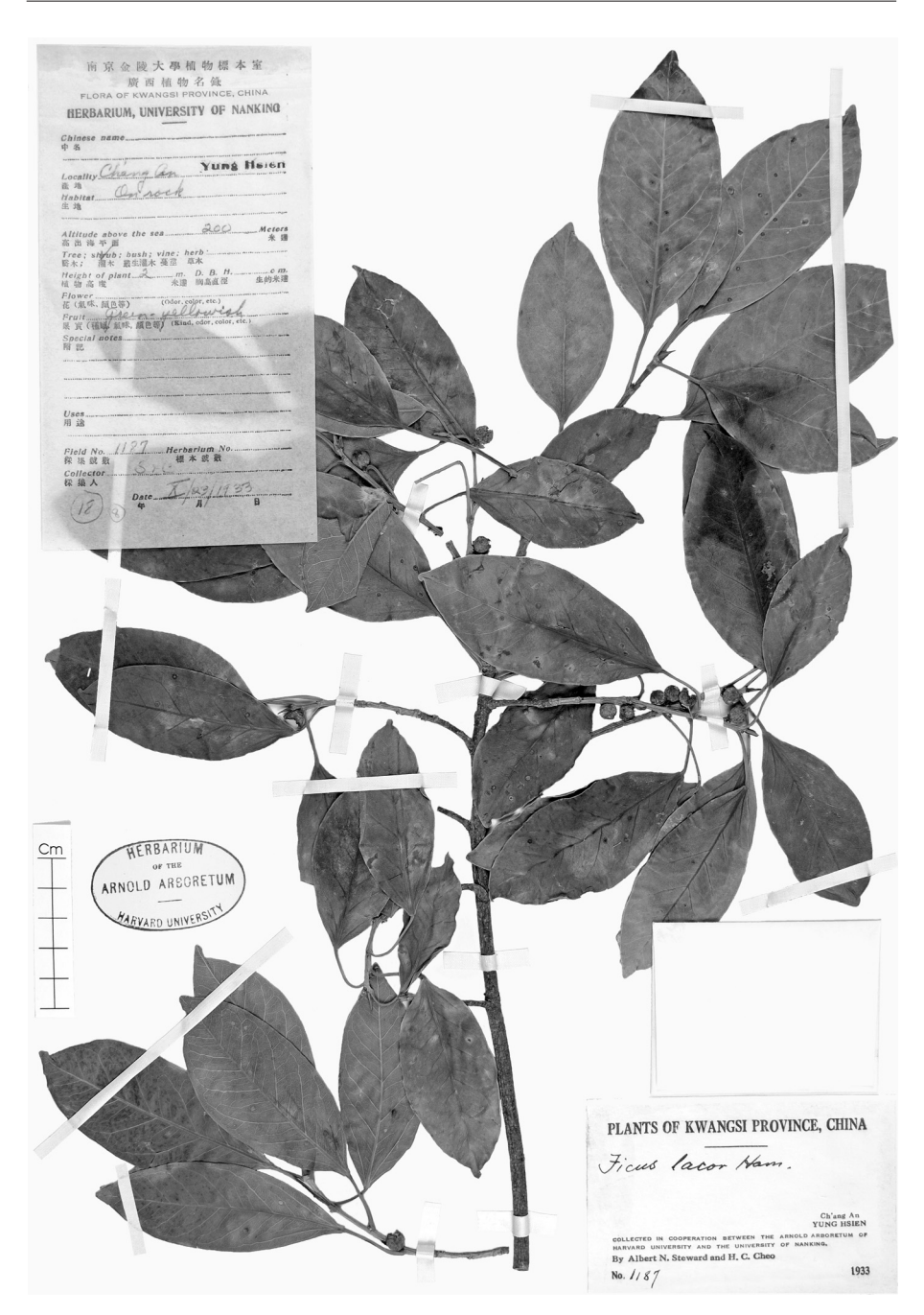
Fig. 2. Ficus alongensis Gagnep., Steward & H.C. Cheo 1197 (A), China, Guangxi, 200 m.