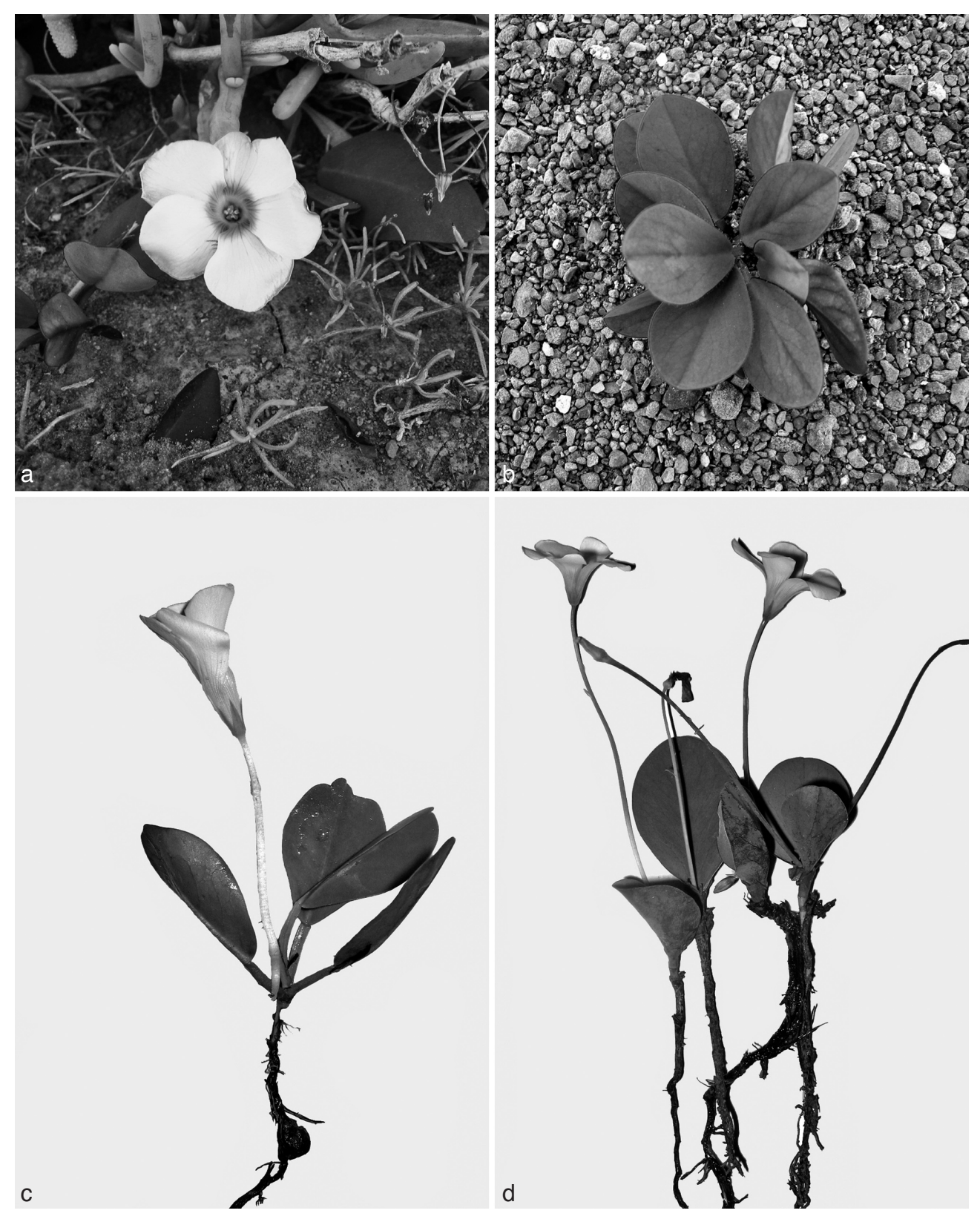
Fig. 3 a-c: Oxalis flava L. var. unifoliolata Dreyer & Oberl. a. Flower; b. typical habit; c. side view. — d. Oxalis salteri L.Bolus side view.