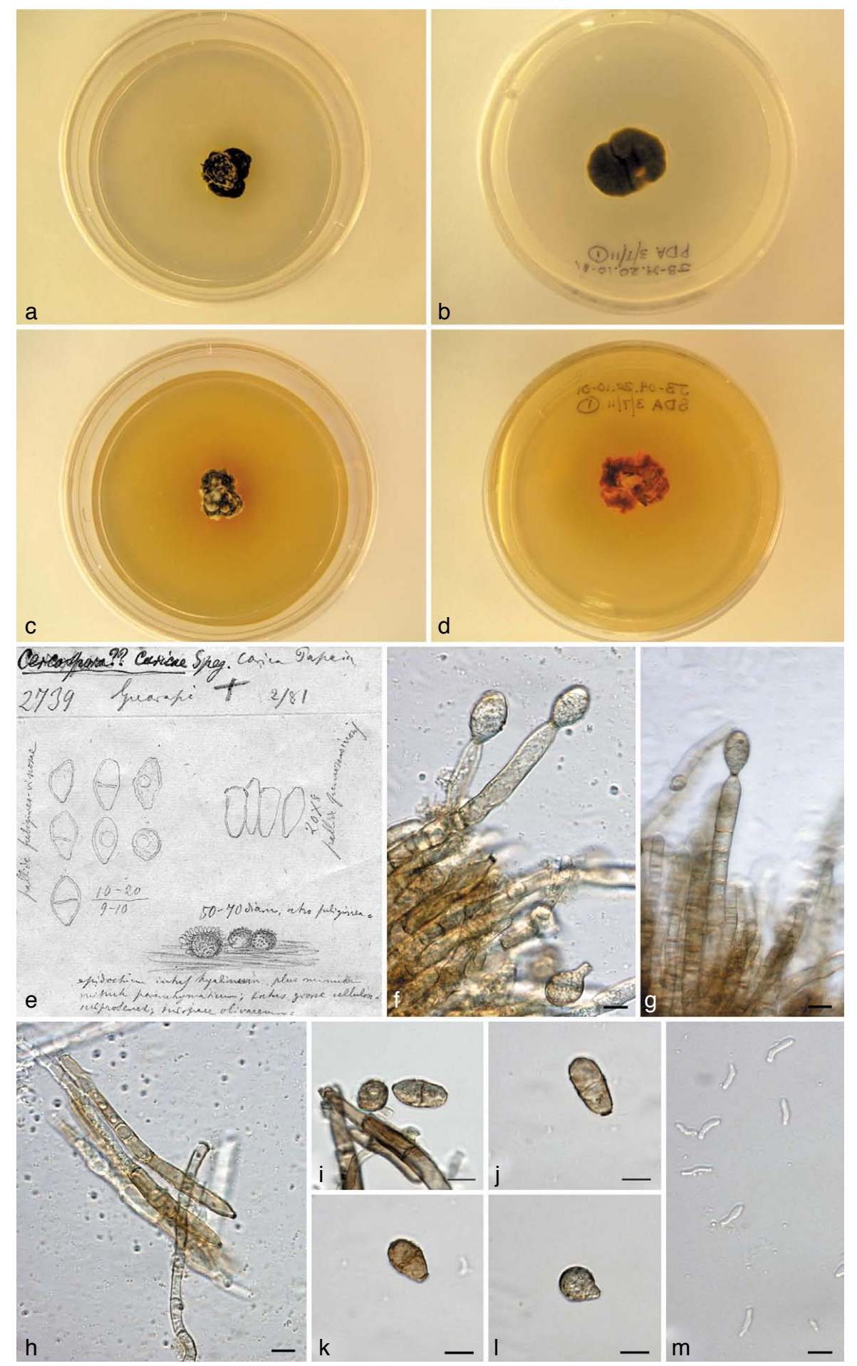
Fig. 2 Cultures and microscopic features of Asperisporium caricae . a–d. Ex-epitype (CBS 130298) at approximately 1 mo at 24 °C with a 12 h light/dark regimen: a. PDA; b. reverse on PDA; c. SDA; d. reverse on SDA. — e. Lectotype packet, No. 2739 (LPS). — f–m. Ex-epitype (CBS 130298) on SDA; f–h. conidiophores and conidia; i–l. conidia; m. spermatia. — Scale bars = 10 µm for all.