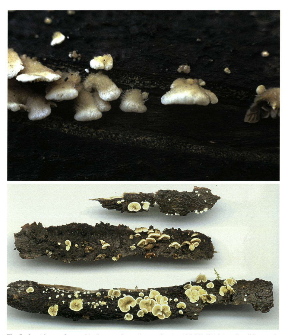
Fig. 2. Crepidotus cristatus. Fresh carpophores from collection GI1999-101 (above) and from collection GI2001-302 (below).

Pileipellis a transition between a trichoderm and a cutis with mostly straight, more rarely flexuous, filiform, 2-3~\mu m wide hyphae; in lower part scattered fragments covered with small crystals and slightly thick-walled hyphae not rare; terminal cells undifferentiated, especially at pileus margin often in the shape of cheilocystidia with outgrowths and covered with small cuboid crystals; strigose hairs at point of attachment composed of straight, slightly thick-walled hyphae. Pileitrama regular, hyaline. Pigment yellowish, rather indistinct, intracellular and faintly membranaceous in pileipellis, dissolving in ammonia. Clamp-connections abundant in all tissues.