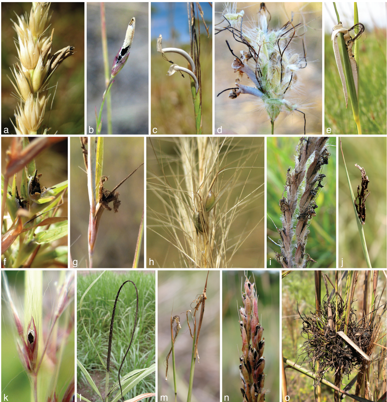
Fig. 2 Diversity of soral morphology in Sporisorium . a. S. cenchri-elymoidis on Cenchrus elymoidis ; b. S. cryptum on Yakirra sp.; c. S. heteropogonicola on Heteropogon contortus ; d. S. bothriochloae on Dichanthium sericeum ; e. S. tumefaciens on Chrysopogon sp.; f. S. isilematis-ciliati on Iseilema sp.; g. S. themedae on Themeda triandra ; h. S. aristidicola on Aristida sp.; i. S. likhitekerajae on Ischaemum sp.; j. S. doidgeae on Capillipedium parviflorum ; k. S. sacchari on Saccharum sp.; l. Ustilago scitaminea on Saccharum officinarum ; m. Sporisorium caledonicum on Heteropogon contortus ; n. S. ischaemum on Ischaemum indicum ; o. S. holwayi on Andropogon bicornis .