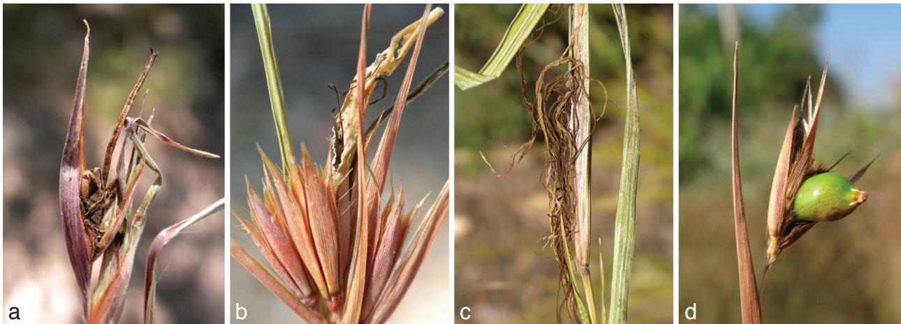
Fig. 4 Four smuts that occur on Themeda . a. Sporisorium benguetense ; b. S. anthistiriae ; c. S. enteromorphum ; d. Macalpinomyces bursus .

their morphological traits (Stoll et al. 2003, 2005). Stoll et al. (2005) noted strong evidence that smuts had co-evolved with their grass hosts, and sister taxa usually occurred on closely related grasses.