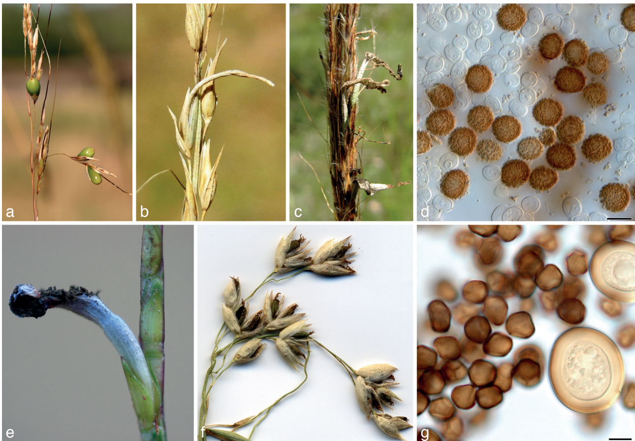
Fig. 3 Diversity of soral morphology in Macalpinomyces . a. M. ewartii on Sorghum timorense ; b. M. arundinellae-setosae on Arundinella setosa ; c. M. mackinlayi on Eulalia mackinlayi ; d. spores of M. mackinlayi ; e. M. siamensis on Coelorachis striata ; f. M. eriachnes on Eriachne helmsii ; g. spores of M. eriachnes . — Scale bars: d, g = 10 µm.