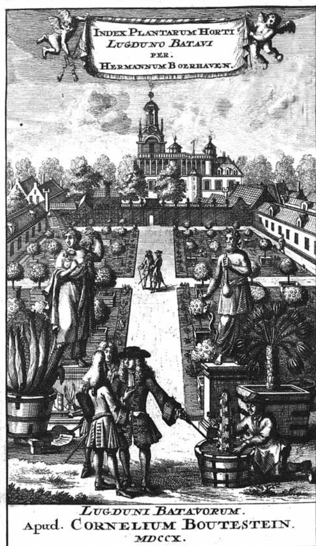
Fig. 5 Hortus Academicus Lugduno-Batavus as depicted in Boerhaave (1710).