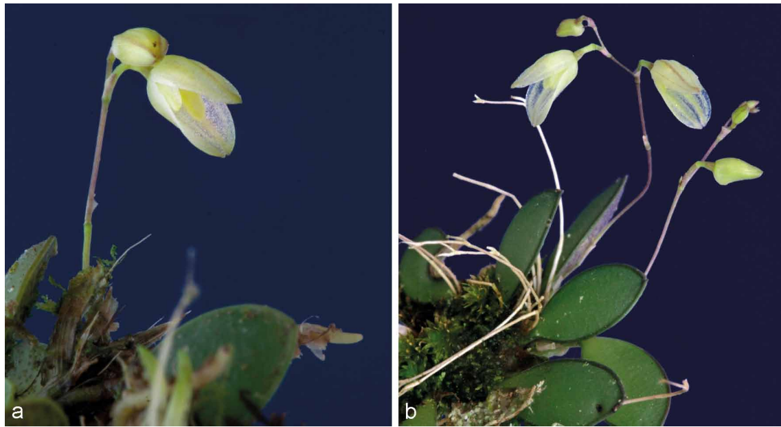
Fig. 2 Specklinia lugduno-batavae Karremans, Bogarín & Gravend. a. Close-up on a flower; b. showing the habit (a. Pupulin 7709; b. Bogarín 6761, both JBL-spirit) — Photos by: a. A.P. Karremans; b. D. Bogarín.